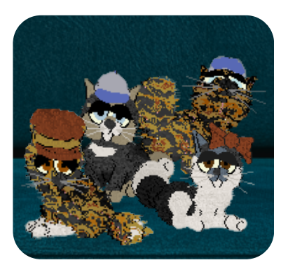
SGCH Litter by VT

Four adorable kittens remain out of a SGCh catz litter bred by V-T.